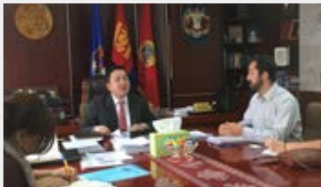
Analyzing the feasibility of recycling wastewater to reduce groundwater demand in Mongolia