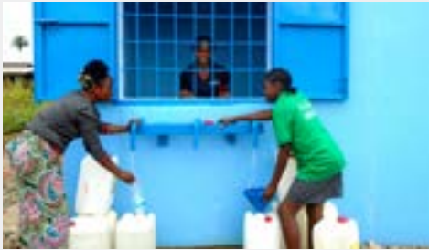
Enhancing water treatment networks to reduce water-borne illness and boost economic growth in Liberia