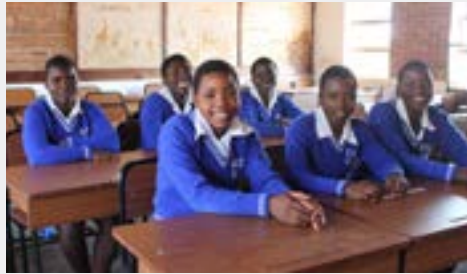
Designing and overseeing construction of schools to expand access to secondary education in Malawi