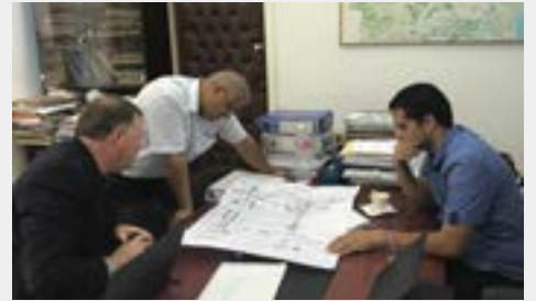
Identifying and prioritizing projects that strengthen the water sector and reduce water scarcity in Tunisia