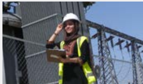
Expanding access to reliable water, sanitation, power, and transportation infrastructure in Afghanistan