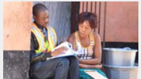
Resolving resettlement issues to advance water supply, sanitation, and drainage improvements in Zambia