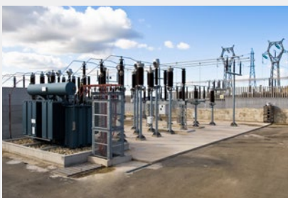
Turnaround strategies to increase efficiency and boost financial performance at electric utilities worldwide