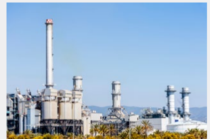
Serving as transaction advisor for a waste and recycling center PPP in the Middle East