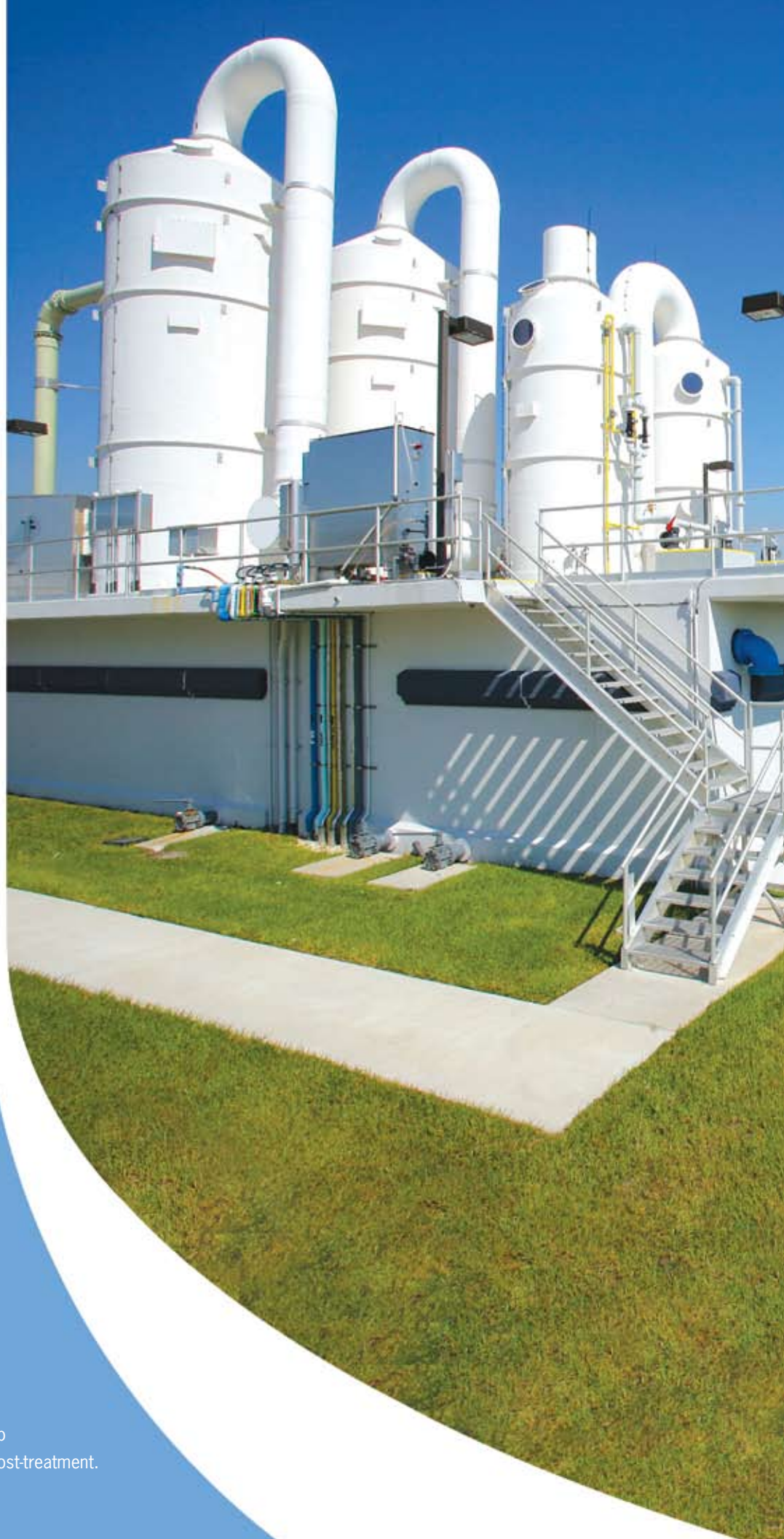
Degasification units at the Port St. Lucie James E. Anderson ROWTP. Degasifiers strip hydrogen sulfide from product water during post-treatment.

Tetra Tech provides communities with drinking water facilities that protect public health and improve the quality of life.