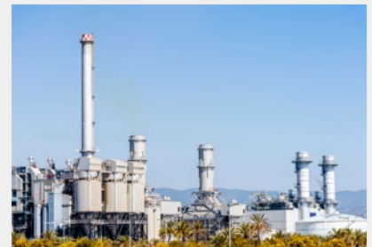
Serving as transaction advisor for a waste and recycling center PPP in the Middle East