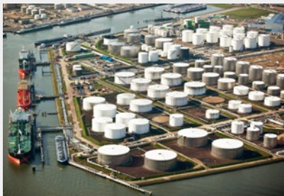
Business case and financing strategy for a proposed oil terminal in the Middle East