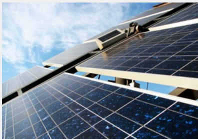
Feasibility studies for several grid-connected solar PV projects in Africa