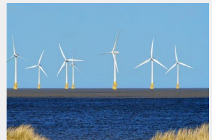
Transaction and financial structuring advisory for renewable energy projects in Sub-Saharan Africa